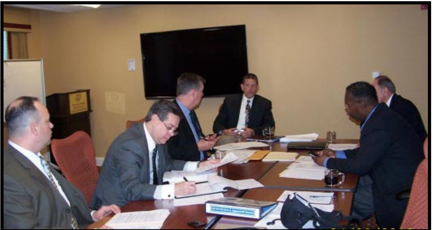
“Your Board at Work”

PRESENTATION MEDIUM: Course content is presented by an instructor. Lecture and discussion is augmented by videotapes of the offenders and victim law enforcement personnel. Handout materials will consist of “Killed in the Line of Duty,” “In the Line of Fire,” and “Violent Encounters.”