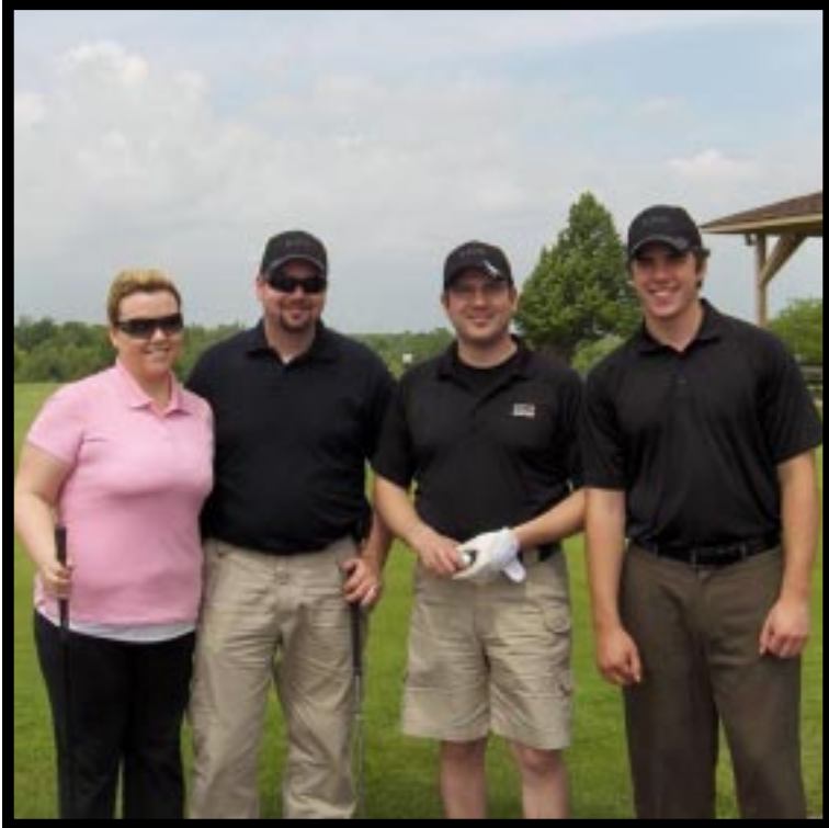
“One of our sponsors, 511 Tactical, sent along a team to compete.”